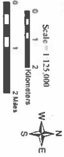
Location Map Utah BLM Field Office Boundaries